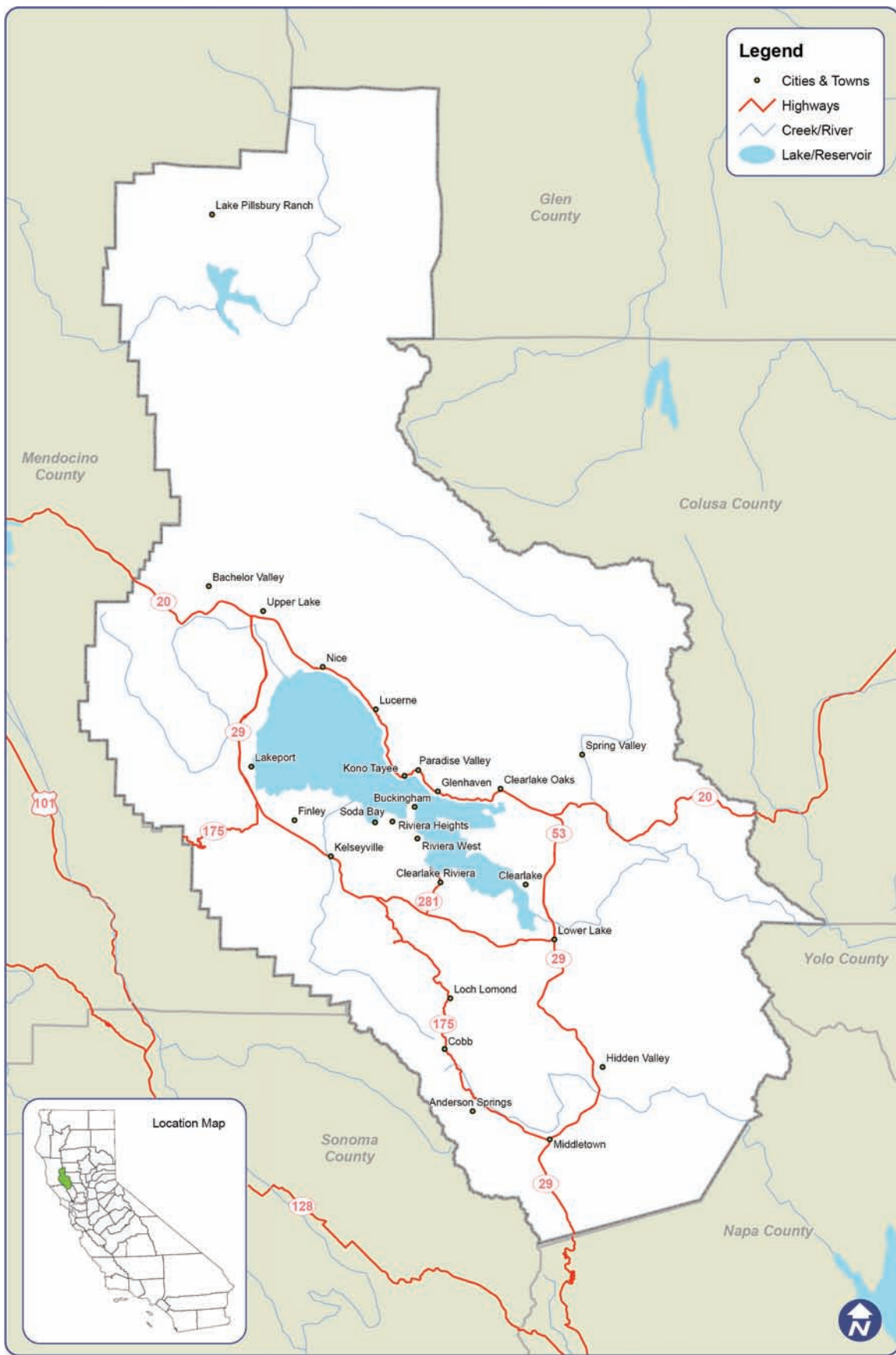
Figure 1-1 Lake County Map